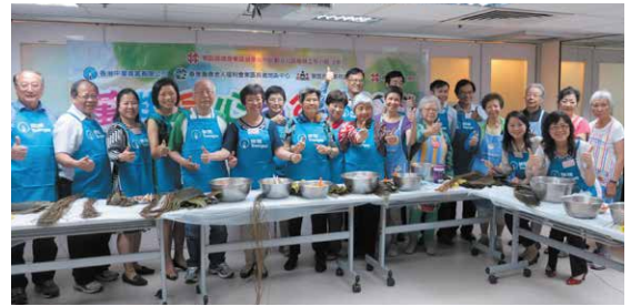
地區義工踴躍參與裹糰活動，讓有需要人士也能歡度佳節。 Local volunteers actively participated in wrapping rice dumplings for the needy people to celebrate Dragon Boat Festival.

Under the guidance of the organic farm instructor, students from Hong Chi Association fully enjoyed the fun of organic farming.