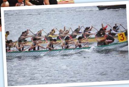
煤氣龍舟隊在大埔區龍舟競賽中力爭上游。 Towngas Dragon Boat Team strived for excellence at Tai Po District Dragon Boat Race.

As in past years, the Towngas Dragon Boat team participated in races around Hong Kong, and this year again won laurels in several Dragon Boat contests. The Team was the champion in "Repulse Dragons Contest – Men's Small Dragon Charity Race – Gold Bowl", "Stanley Dragon Boat Warm-up Match – Men's Standard Dragon Open – Gold Plate" and "Eastern Dragon Boat Race – Men's Standard Dragon Race (Corporate Race).