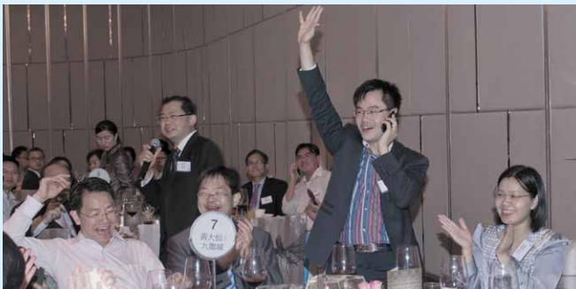
在九龍區的遊戲環節，大家玩得非常投入。 Team members and guests had fun at the games held for Kowloon district.