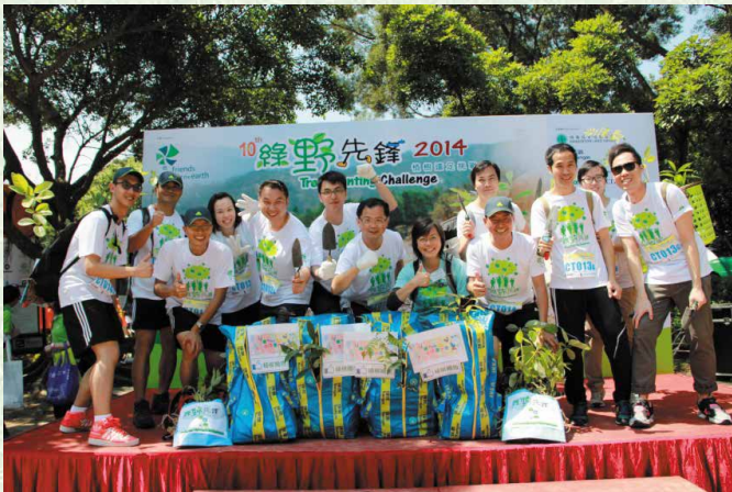
煤氣公司代表隊出發前在台上大合照。 A group photo of Towngas team members.

Towngas has been a sponsor of “Tree Planting Challenge” organised by Friends of the Earth for ten consecutive years. The activity was held in Ma On Shan Country Park on 21 April and three teams from our company participated in the challenge. Since the launch of the “Tree Planting Challenge”, over 83,000 trees have been planted to help alleviate global warming.