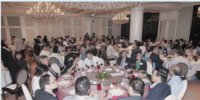
新界區區議員聚首一堂。 New Territories District Councillors gathered at the dinner.

5月期間，煤氣公司分別於香港、九龍及新界區舉辦區議會聯絡小組周年晚宴，區議會聯絡小組成員與各區議員及民政事務專員聚首一堂，了解市民對公司服務的意見。