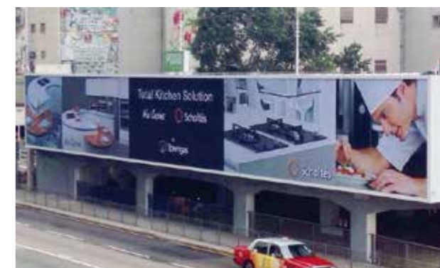
● 位於中環大會堂外的大型戶外廣告。 The large outdoor billboard located outside Hong Kong City Hall, Central.

In order to further promote kitchen cabinet and European kitchen appliance businesses, and to raise the popularity of the Mia Cucina and Scholtès brands, the Company specially launched a large-scale promotional campaign entitled “Towngas Total Kitchen Solution”. Alongside advertisements on television and in all major newspapers and magazines, the Company also set up a large outdoor billboard, promoting the Company’s ability to create a perfect kitchen for customers, with the support of a professional team and high-quality products and services.