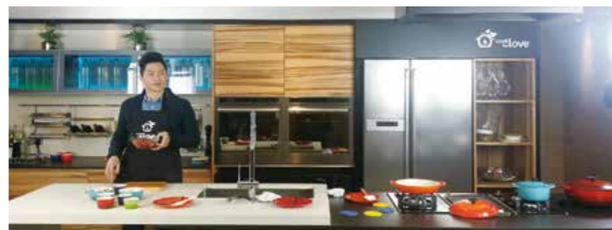
● 短片故事分為上下集「森美煮意之二人叉燒飯篇」及「森美煮意之忘不了的菠蘿炒飯篇」。 The narrative short film is divided into two parts: “Sammy Loves Cooking: Our Grilled Pork with Rice” and “Sammy Loves Cooking: The Unforgettable Pineapple Fried Rice”.