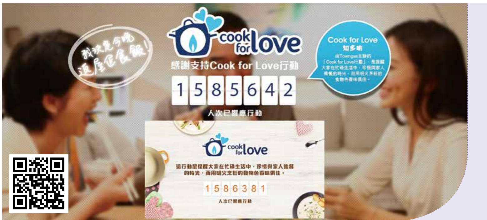
● 「Cook for Love」活動反應熱烈，推出至今累計參加人次逾 150 萬！ “Cook for Love” campaign has received an enthusiastic response, with over 1.5million participating entries so far.