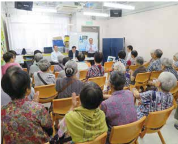
● 客戶服務關注小組成員於6月9日拜訪荃灣福來邨居民。 Customer Focus Team met with residents at Tsuen Wan Fuk Loi Estate on 9 June.