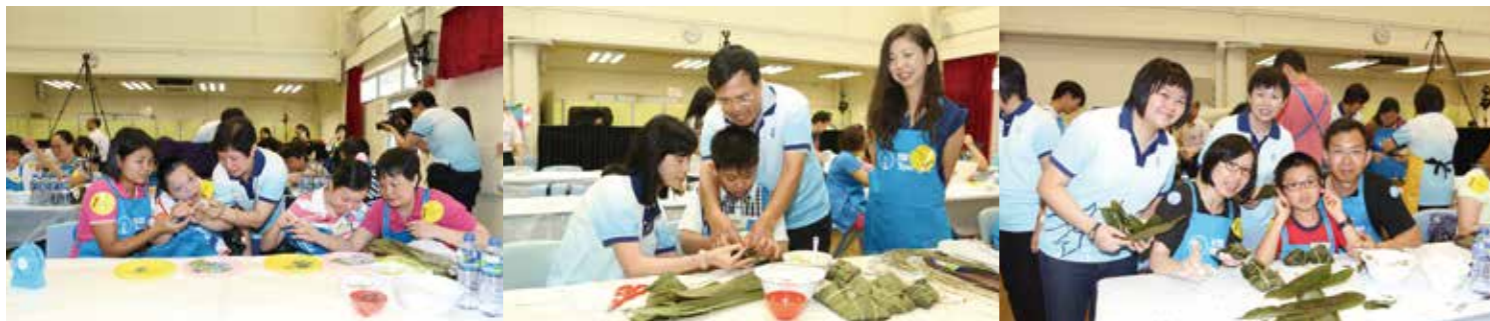
煤氣義工與耀能協會的家庭一起包裹低碳糰。 Towngas volunteers and participants shared a moment of joy wrapping low carbon rice dumplings.

This year, Towngas collaborated with nearly 240 Legislative Councillors, District Councillors, members of over 16 local organisations and volunteers from all over Hong Kong to wrap and distribute 330,000 rice dumplings for the elderly living alone and the needy.