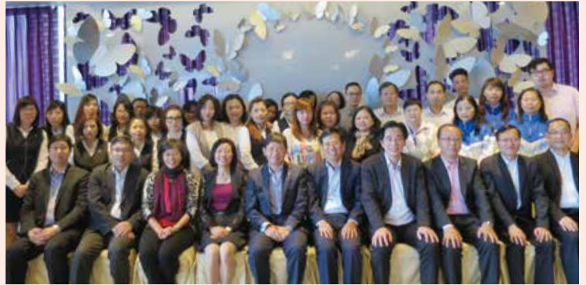
● 煤氣公司定期邀請獲客戶讚賞的同事出席答謝午宴。 Towngas hosts regular luncheons for employees receiving customer compliments.

In 1994, Towngas received 59 compliment letters in total; this number has grown nearly 100-fold over the years to hit 2014's record total of 5,419. As this number demonstrates, Towngas receives nearly 15 letters a day, 365 days a year, proving that customers are growing more and more satisfied with the Company's services.