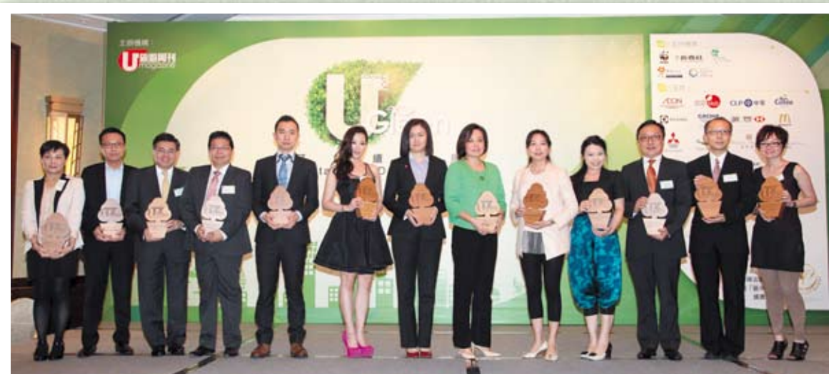
U Green Awards得獎者合照。 Group photo of winners of U Green Awards.