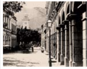
1880年，一盞煤氣燈佇立於中環皇后大道中。 A gas lamp at Queen's Road Central in 1880.