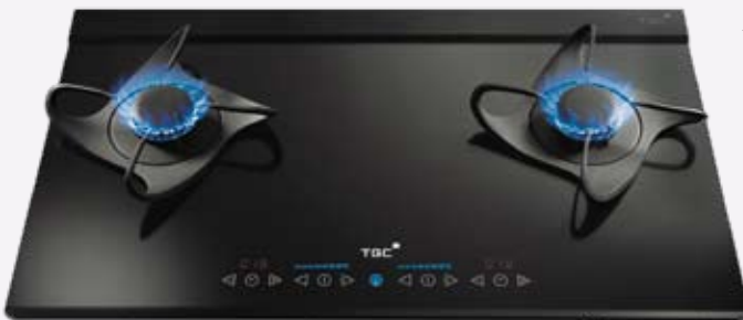
Vortex嵌入式平面爐 Vortex Built-in Hob

Since its launch in 2000, Towngas house brand TGC has provided a diversified range of quality and innovative gas appliances to customers. To celebrate Towngas' 150th anniversary, TGC has launched a special edition appliance series called the Perfecto Series that includes the Vortex Built-in Hob and the Infinity Water Heater. The Vortex Built-in Hob, with its unique vortex-shaped cast stainless steel pan support and novel pop-up digital-display control panel, embodies the perfect combination of style and innovation. Sensor touch nine-step flame suits various cooking needs. The Infinity Water Heater features a panel made of state-of-the-art polycarbonate material and a LED temperature selection display; its sleek design is the perfect fit for the stylish bathrooms of modern homes.