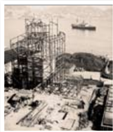
興建中的馬頭角廠房。 Ma Tau Kok works under construction.

為廚藝學徒和中外女士首辦烹飪班。 Introduced Hong Kong's first cooking classes for "cookboys" and "Chinese and European ladies".