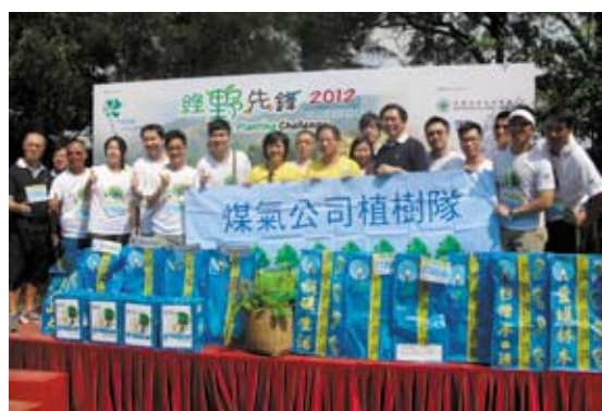
公司的隊伍整裝待發，在起步前來個大合照。 Towngas teams in full gear before setting off.