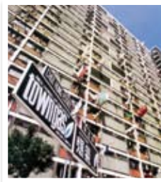
1982年開始為彩虹邨供氣。 Our services arrive at Choi Hung Estate in 1982.