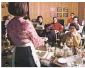
1972年舉辦的烹飪班。 A cooking class in 1972.