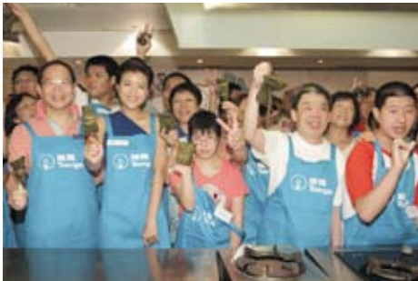
匡智會的會友在煤氣義工細心指導下包裹應節糰子。 Hong Chi Association members, guided by Towngas volunteers, wrapped rice dumplings.