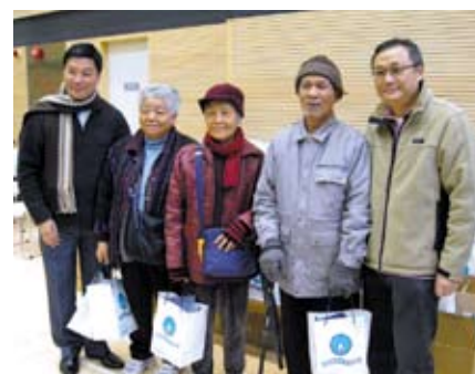
今年2月，客戶服務關注小組探訪東頭邨居民。 The Customer Focus Team visited Tung Tau Estate in February.

Consisting of senior staff from Customer Services, Customer Accounts and Retail Marketing, the team visits two public housing estates or private residential developments every month to discuss issues related to Towngas services, such as gas safety, bill payment and gas appliances. The team also solicits comments and views from customers so as to provide even better products and services.