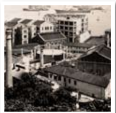
座落西環的首座廠房。 Towngas West Point works.