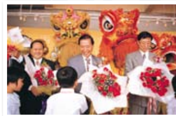
公司主席李兆基博士主持番禺港華煤氣有限公司的開業典禮。 Towngas Chairman Dr the Hon Lee Shau Kee officiates at the opening ceremony of Panyu Hong Kong and China Gas Company Limited.