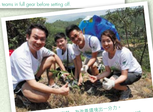
公司員工親手種下小樹苗，為改善環境出一分力。 Our staff planted seedlings to help create a better environment.