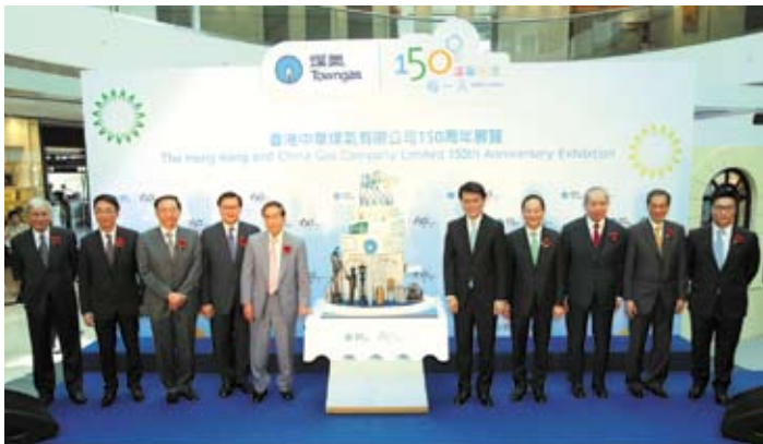
煤氣公司主席李兆基博士暨全體董事與時任環境局局長邱騰華主持切餅儀式。 Towngas Chairman Dr the Hon Lee Shau Kee, along with other board members, presided with Edward Yau, the then Secretary for the Environment of the Hong Kong SAR Government at the cake-cutting ceremony.

煤氣公司150周年展覽以「暖意香江」、「溫馨廣告車」、「低碳Action!」、「百年基業」及「煤氣新紀元」五大展區介紹煤氣公司歷史演變，並陳列早期的產品，部分更是首次公開展出，例如以煤氣驅動的私家車、風扇和熨斗，以及1920及1930年代的古董煤氣熱水爐和煮食爐。此外，還有不同年代的煤氣燈供市民拍照留念。