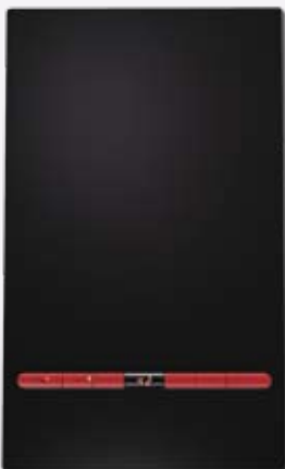
Infinity熱水爐 Infinity Water Heater