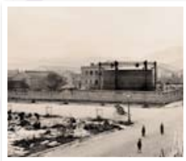
1890年代的佐敦道煤氣廠。 Jordan Road gas works in 1890s.

佐敦道廠房投產，煤氣供應擴展至九龍區。 Commissioned Jordan Road gas works. Gas supply extended to Kowloon district.