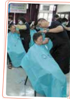
Towngas volunteers provided haircutting services.