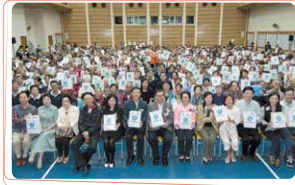
The Haircutting Team provided haircutting services for about 800 elderly.

Towngas organised "Haircutting for the Elderly 2013" event in collaboration with the Hong Kong Federation of Trade Unions on 17 November, which was International Senior Citizen's Day. Over 100 volunteers provided haircutting services for about 800 elderly. Towngas also invited artistes to perform old-time pop songs and play games with the participants. This activity is part of our "Caring for the Elderly" programme which not only aim to provide care and support for the elderly, it also seeks to encourage more people to take part in social services.