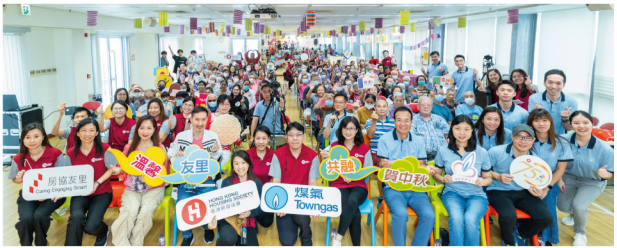
煤氣公司與香港房屋協會再度攜手，於觀龍樓舉辦「友里溫馨賀中秋」活動，線上線下與長者及少數族裔家庭一起，共融共樂度中秋。 Towngas joins hands with HKHS again to hold the "Celebrating Mid-Autumn with Your Neighbours" event at Kwun Lung Lau celebrating the Mid-Autumn Festival with the elderly and ethnic minorities attending both online and offline.

早前，煤氣公司與香港房屋協會連續第三年於堅尼地城觀龍樓舉辦「友里溫馨賀中秋」活動，透過網上直播予其他屋邨「老友記」，線上線下與300位長者預祝中秋。