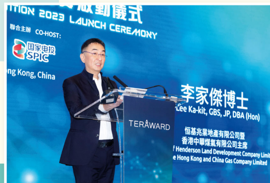
主禮嘉賓：煤氣公司主席李家傑博士 Officiating Guest: Dr Lee Ka-kit, Chairman of Towngas

第三屆TERA-Award「碳洩未來」智慧能源創新大賽現已接受報名，並將於2023年12月17日截止報名，誠邀全球科創團隊參與，尋找智慧能源領域的創新技術和解決方案，共同為零碳願景目標進發。