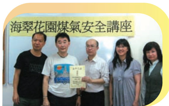
▲ 客戶服務關注小組今年8月於海翠花園進行第449次探訪。 The Customer Focus Team reached out to Pierhead Garden in August, making 449 th visit.

Consisting of senior staff from Customer Services, Customer Accounts and Retail Marketing, the team visits two public housing estates or private residential buildings every month to discuss issues related to Towngas services, such as gas safety, bill payment and gas appliances. The team also solicits comments and views from customers to provide even better products and services.