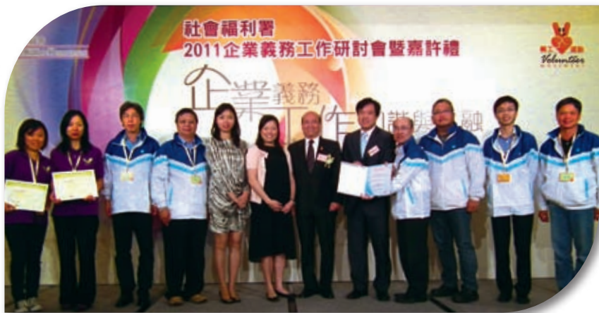
◀ 煤氣溫馨義工隊隊員接受獎項。 Towngas Volunteer Team members receive the award.

Towngas Volunteer Service Team receives “2010 Volunteers with Service Hours exceeding 10,000 Award”