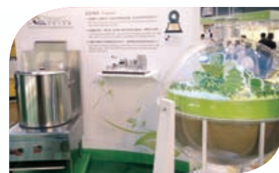
▲涼廚系列的產品提升能源效益，獲環保業界參展商的讚許。

This year, Eco Expo Asia featured a "Green Tech for a Low-carbon Economy" theme. It attracted more than 260 exhibitors from 16 countries and regions to the fair to showcase Eco-friendly products, innovation and green solutions.