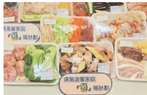
CookEasy 煮餸易為計劃提供的新鮮餸菜包。 Nutritious fresh food packs prepared by CookEasy.