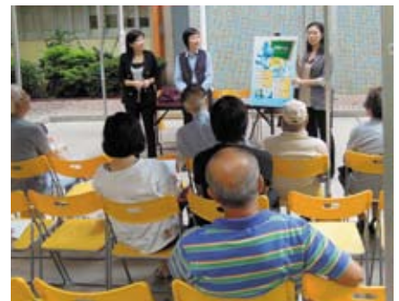
煤氣客戶服務關注小組於去年10月探訪愛蝶灣。 Towngas Customer Focus Team visited Aldrich Garden in October 2012.

Consisting of senior staff from Customer Services, Customer Accounts and Retail Marketing, the team visits two public housing estates or private residential developments every month to discuss issues related to Towngas services, such as gas safety, bill payment and gas appliances. The team also solicits comments and views from customers so as to provide even better products and services.