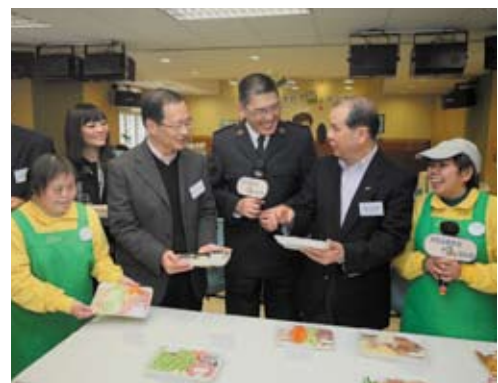
CookEasy 煮餸易的員工向主禮嘉賓介紹新鮮餸菜包。 Employees from CookEasy introduced the fresh food packs to the officiating guests during the launching ceremony.