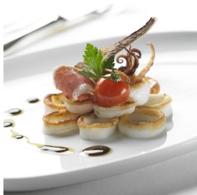
魷魚暖沙律 Warm Squid Salad