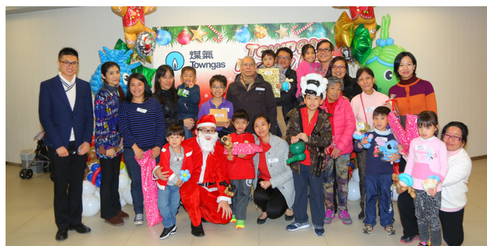
續 Fun 生活每一天：聖誕同樂日

We fully support our employees to strike a balance between work and life. In addition to improving the Company's policies, we invest more resources to arrange a variety of activities for our employees and their families so that they can enjoy happy moments together and enhance their communication and cohesion.