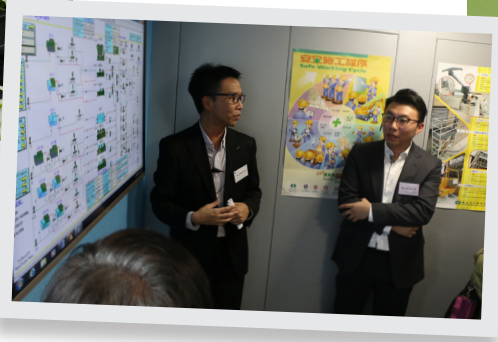
同事介紹高效無油冷凍機組的應用。

Our employees introduced the application of high energy efficiency oil-free variable speed water-cooled chiller.