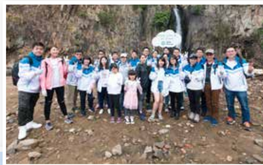
煤氣公司同事及親友積極響應，身體力行，為清潔香港出一分力。 Towngas staff and their family and friends show their enthusiasm by taking part in cleaning up Hong Kong.