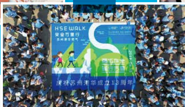
▲ 集團上下一心，當天超過 140 家公司一同舉步，聲勢浩大。

Staff members from over 140 companies joined the walk in a perfect demonstration of team spirit.