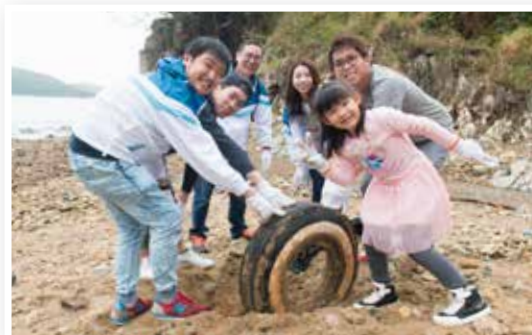
煤氣公司同事及親友參與於香港仔瀑布灣的大型淨灘活動。 Colleagues from Towngas and their family joined the Massive Beach Clean-up, which was held at Waterfall Bay in Aberdeen.

Towngas hopes our staff and their friends and family can support and promote ecological conservation as well as the philosophy of sustainable development.