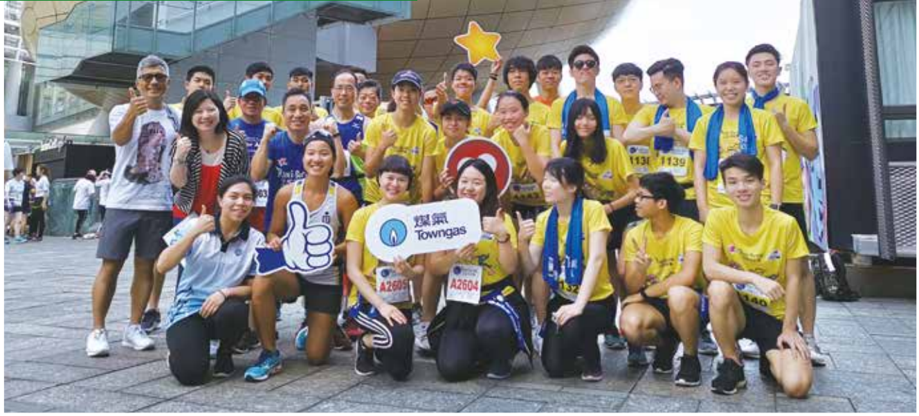
由煤氣公司贊助出賽的同事及大專學生在賽前合影。 Staff and post-secondary students sponsored by Towngas at the event.

煤氣公司為第五屆「生態保衛賽」慈善跑的主要贊助機構之一，活動由香港海洋公園保育基金主辦，5月19日於香港科學園舉行，吸引逾2,200名跑手參加。「生態保衛賽」慈善跑今年以「成為保育英雄，秒殺海洋垃圾」為題，推廣生物多樣性及海洋保育，鼓勵大眾減少使用即棄塑膠產品。