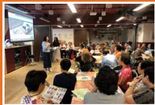
客戶服務關注小組於6月14日到訪救世軍油麻地長者社區服務中心。 Members of Customer Focus Team visited Salvation Army elderly centre in Yau Ma Tei on 14 June.

小組的成員主要來自公司的客戶服務課、客戶會計組及零售市務部等。小組每月平均到訪兩個公共屋邨或私人屋苑，向居民傳達有關煤氣服務、安全須知、繳費方法及煤氣爐具等重要資訊。小組亦會收集客戶對公司產品及服務的意見，從而改善服務質素，進一步加強煤氣公司與客戶之間的聯繫，與各區用戶建立良好關係。