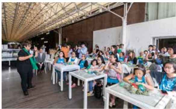
菜姨媽分享家庭和諧的密碼。

Participants wrap a rice dumpling with one person's eyes covered and another using only one hand, symbolising a family contributing their respective skills to achieve success.