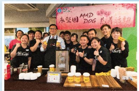
▲ 麥當勞團隊連續第三年支持永堅園Mad Dog慈善活動。 McCafé team supported the Mad Dog Café for the third consecutive year.