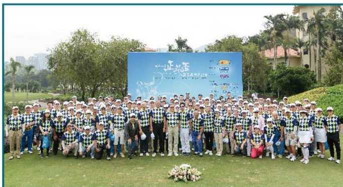
「第十一屆正斗盃高爾夫邀請賽2018」參加者大合照。 Group photo at the 11th Tasty Cup Golf Day 2018.

由煤氣公司贊助之「第十一屆正斗杯高爾夫邀請賽」於2018年11月9日假深圳西麗高爾夫球會圓滿結束。煤氣公司邀請工商市務部的客戶及合作夥伴參與，並組成煤氣公司隊參賽。是次球賽提供極佳平台，讓一眾飲食界同業切磋球技，更有助促進商會間的交流，參加者亦可藉此機會全心享受運動樂趣，同時增進友誼。