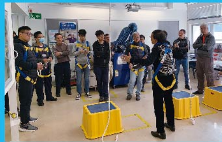
離地工作體驗安全培訓，提升安全。 Training on working above ground to enhance safety.

煤氣公司過往以OHSAS18001職業健康與安全管理系統標準為基礎，落實職安健管理系統於企業各個層面，保障員工及承建商的安全和健康。國際標準組織 (ISO) 於2018年3月正式發布ISO 45001職業健康與安全管理系統標準，進一步提升職業健康與安全水平，持有OHSAS18001認證的機構，需於三年時間內升級轉換到新標準。煤氣公司作為業界領航，率先在一年時間內更新系統文件，並於2018年12月進行審核，完成升級轉換，成為全港首間公用事業在全面運作上取得ISO 45001認證。