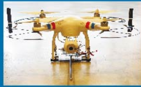
立管檢查飛行器，確保運作安全。 Riser Inspection Quadcopter to ensure operational safety.