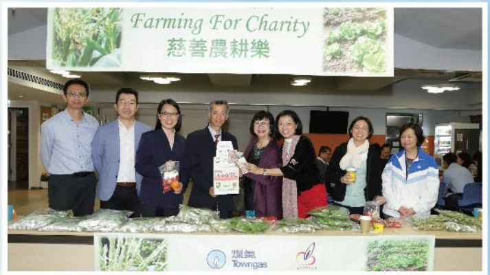
▲ 有機蔬果慈善義賣。 Organic vegetable charity sales.