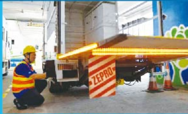
創新研發尾板車自動LED警報系統。 Innovative tailgate truck automatic LED alarm system.