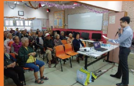
煤氣客戶服務關注小組於2018年11月29日到訪鑽石山鳳德邨。 Members of Customer Focus Team visited Fung Tak Estate at Diamond Hill on 29 November 2018.

The team is made up of members from Towngas' Customer Services, Customer Accounts and Retail Marketing teams. It visits two public or private housing estates every month on average to communicate important information to residents on topics such as customer service, safety tips, payment methods and gas appliances, and also collects customer feedback on Towngas' products and services so that we can enhance service quality and customer communication, and foster a healthy relationship with customers in various districts.