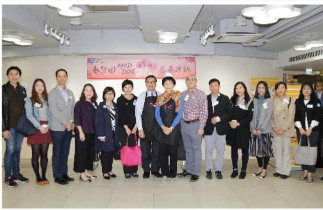
▲ 活動當天，來自不同受惠院舍的代表出席支持善舉。 Representatives from various senior homes supported the event.

This year, 780 sets of Mad Dog set has been prepared, together with proceeds from charity sales of organic vegetables, a total of $455,557 has been raised. Since its inauguration in 2014, the programme has installed 273 electrical washlets and 178 bathroom ventilators for 102 senior homes.