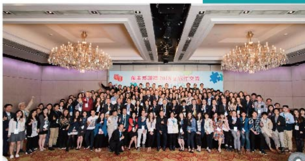
救世軍「僱主感謝禮2018暨協作交流」機構合作夥伴大合照。

Group photo of the Salvation Army Appreciation Reception for Employers 2018.