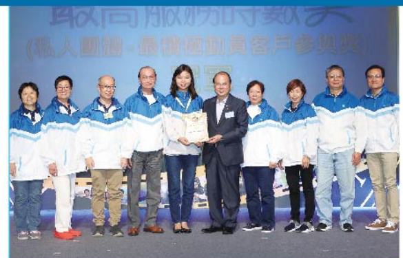
政務司司長張建宗頒發「最高服務時數獎」冠軍予煤氣溫馨義工隊代表。 Matthew Cheung Kin-chung, Chief Secretary for Administration, presents the Champion of Highest Service Hour Award to representatives from Towngas Volunteer Service Team.

Since its establishment in 1999, Towngas Volunteer Service Team has enthusiastically and regularly participated in volunteering service, servicing the community and contributing to society. As of the end of 2018, our volunteers have donated over 875,000 hours of their time collectively.