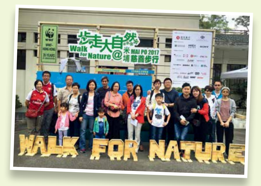
步走大自然 2017 活動獲不少煤氣公司同事支持。

orienteering maps to hunt down Plastic Trasher and Environmental Monsters to protect natural resources. Towngas sent two corporate teams to participate and won the 1st and 2nd runner-up accordingly. The competition enhanced not only team spirit among colleagues but also their awareness towards environmental protection.