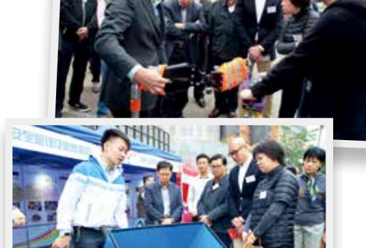
煤氣公司代表向一眾嘉賓及參與者介紹各項創新項目。 Representatives from Towngas introduced various innovation