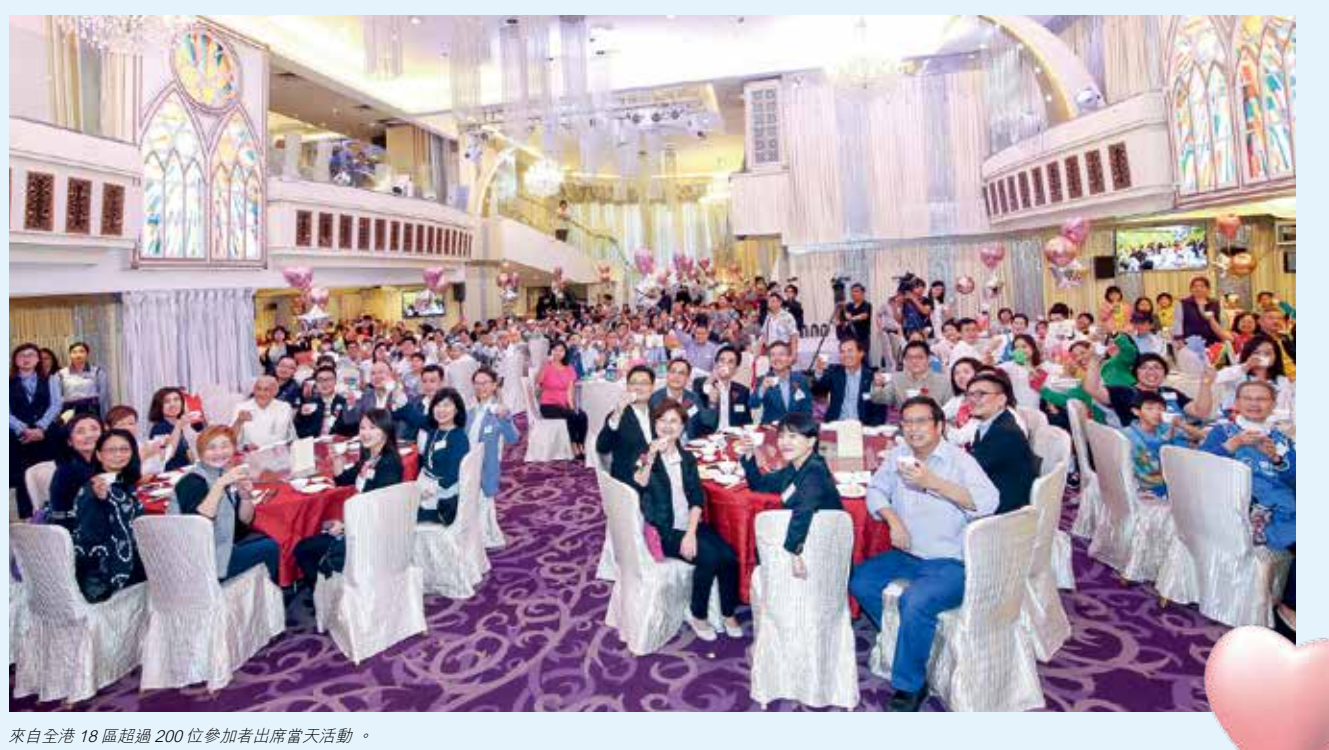
來自全港 18 區超過 200 位參加者出席當天活動 。 Over 200 participants from 18 districts enjoyed an entertaining afternoon.

此外,大會邀請了行政會議成員林正財醫生及民政事務局副局 長陳積志,分別與兩個家庭合作烹調健康親子菜式,與民同樂, 推動社會共融。演藝界名人李家鼎亦為現場參加者親自作烹飪 示範,為活動增添無限暖意。