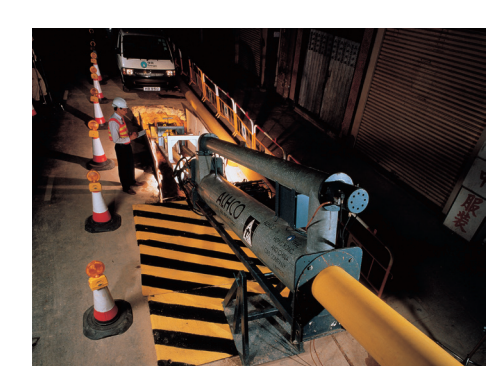
無坑盟挖技術 Trenchless technology

90% and carbon emissions by 60%. We have also installed oil-free variable speed watercooled chillers at our North Point headquarters, lowering the system's electricity consumption by 46.5%, saving more than 1,000,000 kwh every year.