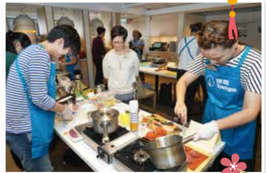
▲ 參賽者即場以明火烹調月餅餡料。 Participants preparing mooncake ingredients using open-flame appliances.