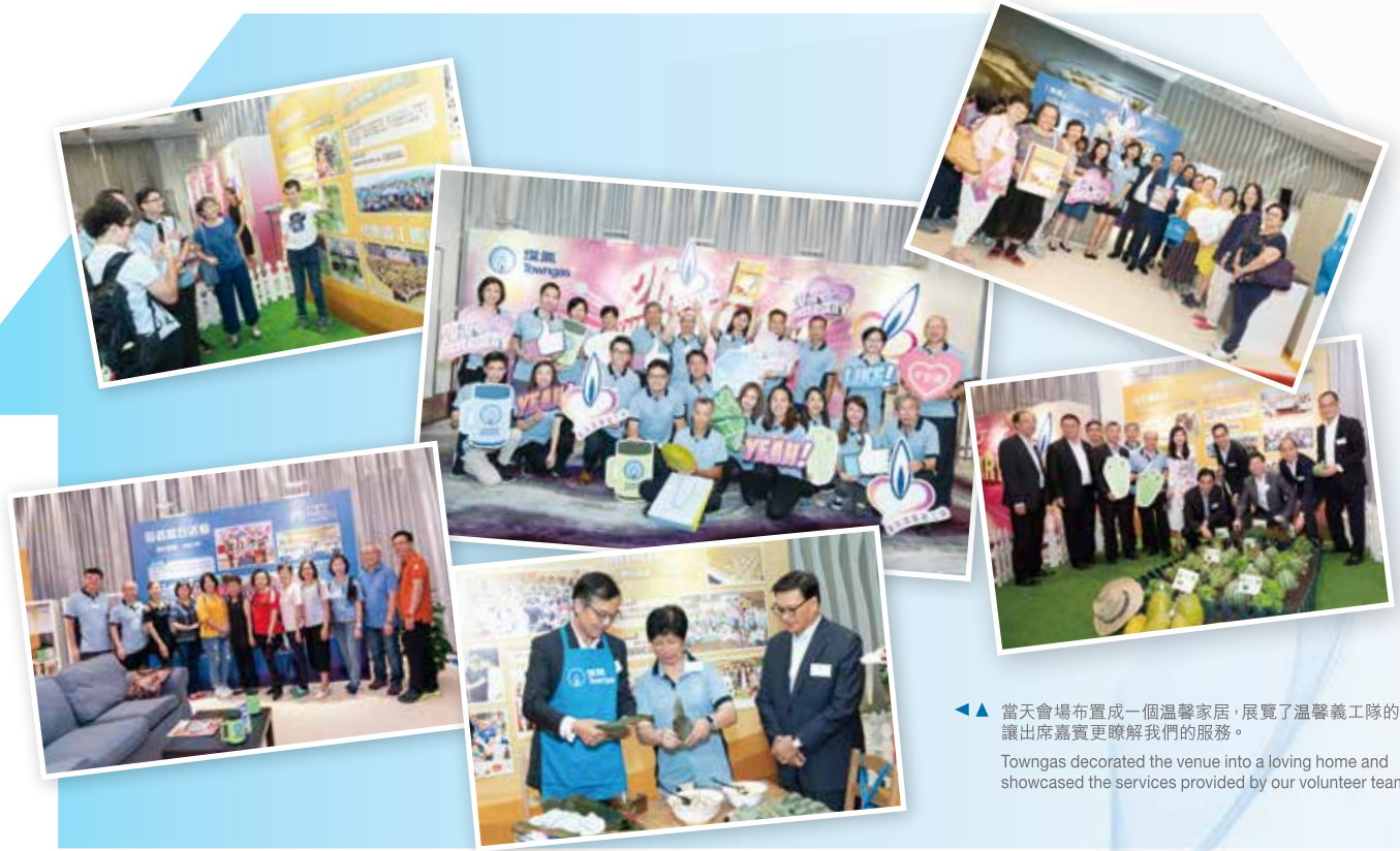
▲ 當天會場布置成一個溫馨家居，展覽了溫馨義工隊的活動，讓出席嘉賓更瞭解我們的服務。 Towngas decorated the venue into a loving home and showcased the services provided by our volunteer team.