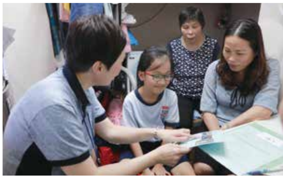
煤氣義工透過家訪，了解學童家庭的居住環境，製作符合其需要的傢俱配件。 Through home visits, volunteers are able to get a sense of the students' household needs in order to design suitable home accessories.