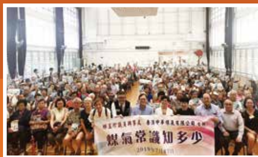
客戶服務關注小組於7月17日到訪鴨洲邨。

電話 /Tel : 2880 6988 傳真 /Fax : 2516 7368 電郵 /Email : cad@towngas.com