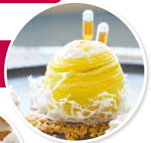
亞軍作品「黃金定栗」 First runner-up: "The Golden Moon"