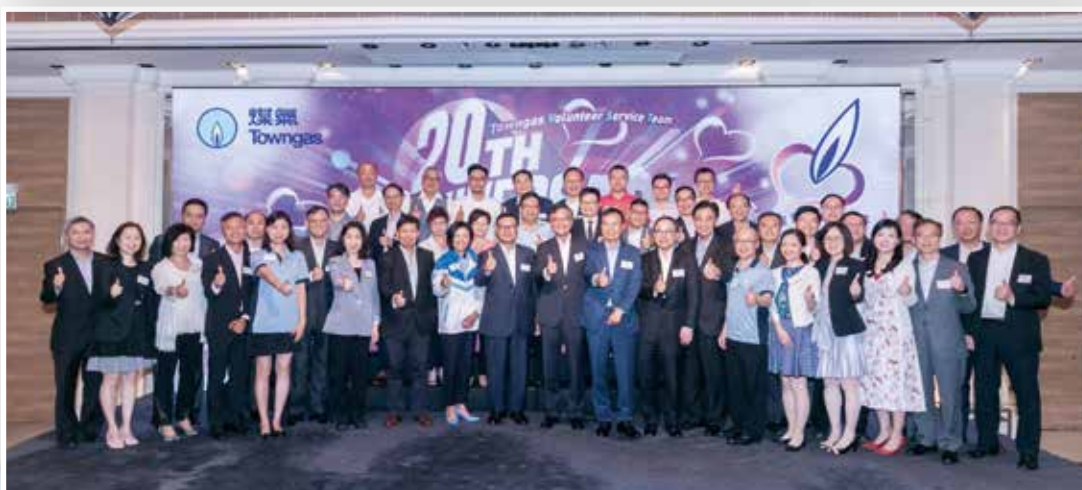
◀ 各區議會一直與煤氣公司合作推動義工活動，當天區議會正、副主席也來同慶 20 周年。