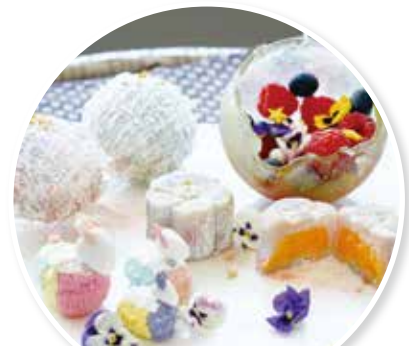
冠軍作品「明明白白我的心」 Winning entry: "You Read My Heart"

Many participants added innovative ingredients to the recipe, creating flavours such as chestnut and Tieguanyin, bubble milk tea, mango pomelo sago as well as beetroot and dates. The winning entry, entitled You Read My Heart, is made with a sugar globe, coconut milk snow skin and egg custard filling, it offers an element of excitement as the sugar globe needs to be broken before one can savour the mooncake, which also signifies the festival's role in breaking the ice among people.