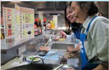
▲ 「煮播」計劃為煤氣公司眾多社會服務之一，旨在延緩輕度認知障礙症患者的病情，為社區老齡化出一分力。 One of Towngas' many CSR programmes is "Chef Anchor" cooking class, aiming to alleviate Mild Cognitive Impairment symptoms and support ageing in the society.