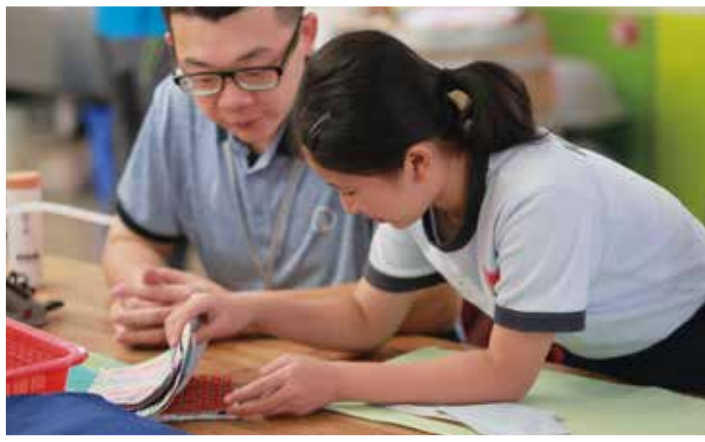
煤氣義工與學童一同發揮創意，製作別具特色的小型傢俱，增加家裡的收納空間。 Volunteer and school kid putting their heads together to create unique home accessories that will increase the storage capacity of her home.

Towngas volunteers also paid visits to the children in their homes to get a sense of their living environment. Through this collaboration between the commercial, education and social service fields, Towngas hopes that concrete action can be taken to transform waste into treasure as a part of our concerted efforts in environmental protection and giving back to society.