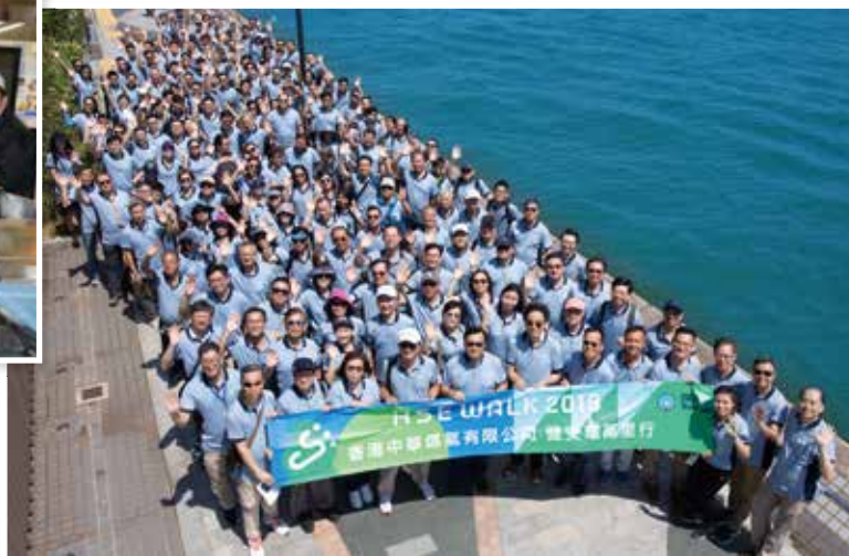
▼ 集團第二屆健安環萬里行。 Towngas Group's 2nd HSE Walk.