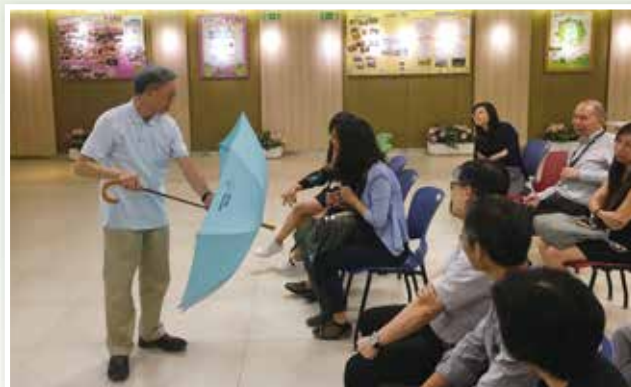
▲ 導師講解雨遮構造。 The speaker explaining the structure of an umbrella.

Hong Kong's unpredictable rain means that many people carry umbrellas with them whenever they go out. Frequently used umbrellas are easily damaged, after which they would become little more than a piece of trash. In order to alleviate the pressure on our landfills, Towngas has organised an umbrella repairing workshop, during which our staff can learn ways to mend their broken umbrellas and contribute to environmental protection. Those who attended the workshop can also borrow repair tools at a later date to repair their own umbrellas.