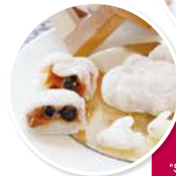
季軍作品「珍珠奶茶冰皮月餅」 Second runner-up: "Snowy Mooncake - Pearl Milk Tea"