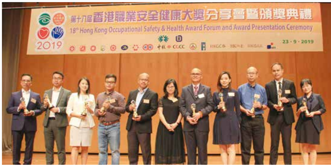
◀ 煤氣集團旗下的公司代表領取「安全表現大獎」：名氣通電訊有限公司 (左三); 卓誠工程有限公司 (右五); 易高一香港石油氣加氣站 (右四)。 Representatives from Towngas Group companies receiving Safety Performance Awards: Towngas Telecommunications Company Limited (3rd from left), P-Tech Engineering Company Limited (5th from right), ECO - Hong Kong LPG filling station (4th from right).

9月23日，煤氣集團於「第十八屆香港職業安全健康大獎」頒獎典禮中獲頒多個獎項，成績輝煌。「香港職業安全健康大獎」由職業安全健康局聯同政府部門、相關機構、工會及商會舉辦，旨在表揚各機構在推行職業安全及健康方面的傑出表現，為業界提供平台互相學習，就職安健最佳實務策略進行交流，提高機構的生產力，以及提升機構在顧客、股東、供應商及業界心目中的企業形象。