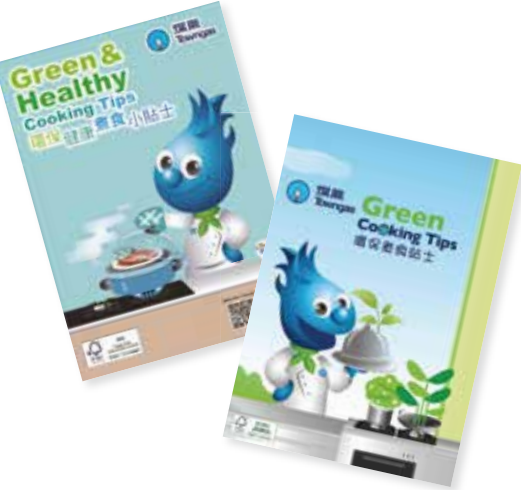
▲ 煤氣公司印製環保煮食小冊子鼓勵公眾奉行環保、健康飲食習慣。 Towngas Green Cooking Tips were published to engage customers to practice low carbon and healthy cooking.