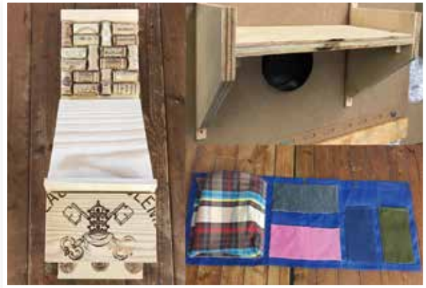
因應不同基層擠迫戶的家居環境，煤氣義工運用工程技能和知識，製作例如木層架、床邊掛袋、木牆身組合等配件。 Towngas volunteers used their technical skills and know-how to create accessories such as wooden shelves, bedside pouches and wall shelving to suite the various needs of the respective cramped households.