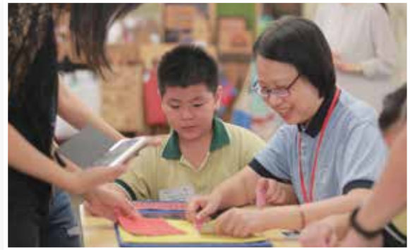
學童夥拍煤氣義工，利用循環再用的舊衣物製作成收納袋，學習「轉廢為寶」。 School kid team up with volunteer as they transformed waste into treasure by upcycling materials from old clothes into a storage pouch.