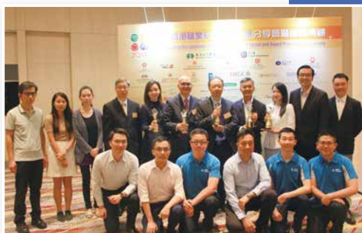
▲ 獲獎代表一同在會場內合照。 Representatives from the winning teams at the ceremony.

Towngas won Silver Award of OSH Enhancement Program Award for its "Smart OSH Warehouse" project with three innovative applications. Manual handling work is replaced by a Vacuum Lifter, which applies suction force to lift up heavy goods and reduces the risk of musculoskeletal disorder and related occupational hazards. An Elevating Platform keeps the goods to be lifted at waist level, so the lifting distance can be minimised to reduce the risk of manual handling operation. Lastly, an Automated Guided Vehicle (AGV) - an intelligent and automatic system, directs the goods shelf to designated location for goods picking in order to minimise walking time in the warehouse. Furthermore, AGV provides light-aided displays and confirmation buttons to reduce human errors. "Smart OSH Warehouse" reduces work related risks and enhances the safety level of warehouse effectively, and at the same time, job satisfaction of colleagues could be improved.