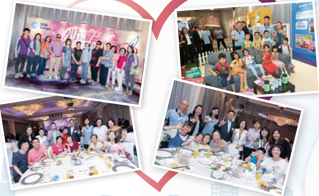
煤氣義工隊過往與不同社福機構合作，服務有需要人士。當天很多服務使用者也有前來和我們慶祝 20 歲生日。 TVST collaborates with various social welfare organisations to help those in need. Many beneficiaries joined us in celebrating our 20th anniversary.