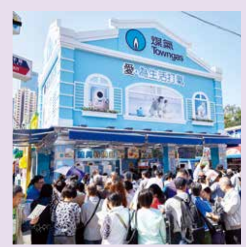
工展會工作團隊緊密合作,發揮團隊精神,再創銷售佳績。 Our sales team at the Expo worked closely together to achieve

煤氣公司展位今年以「夢想的家」為設計意 念,寓意香港人都渴望擁有舒適温暖的家, 公司設計了一間滿載温暖的小屋,採用的色 調和設計令人感覺清新及環保,並以「愛• 為生活打氣」為題,傳達對家人的關愛,希 望為社會發放更多正能量。