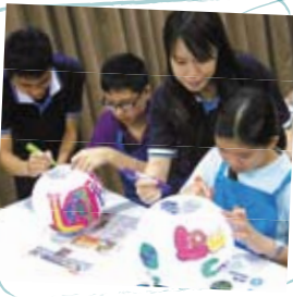
Towngas also organised three Low-Carbon Graffiti Lantern Workshops in early September.

Graffiti artist PANTONE showed the students how to use colour pens and markers to create eco-friendly lanterns. Painting the lanterns with blessings and good wishes, the students were also able to incorporate low-carbon elements into these festive traditions.