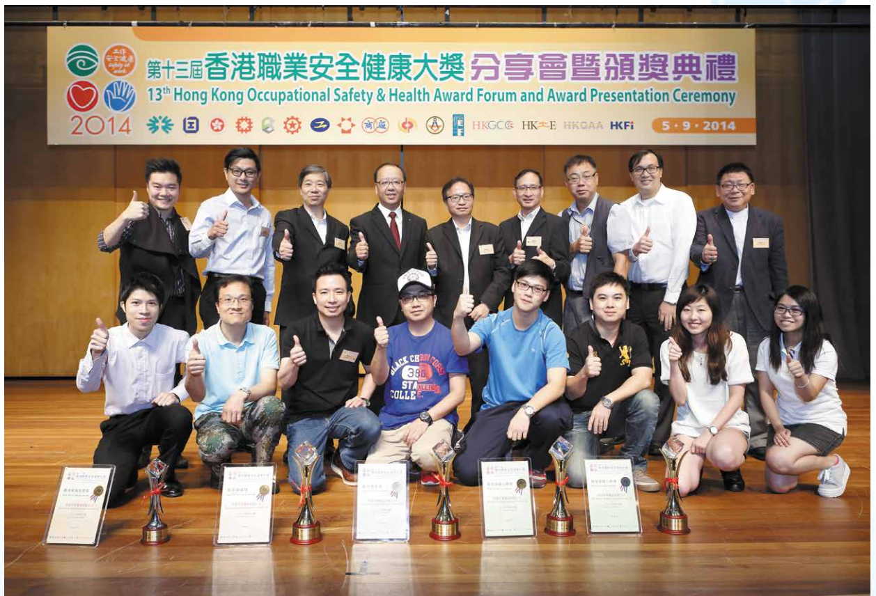
煤氣公司奪得「第十三屆香港職業安全健康大獎」十個獎項，表現卓越。 Towngas won 10 awards in the "13th Hong Kong Occupational Safety & Health Award" for its excellent performance.

煤氣公司一直以安全為首要重任，憑着卓越表現，在9月5日舉辦的「第十三屆香港職業安全健康大獎」中共奪得十個獎項，成為是次活動中奪得最多金獎的機構，足證煤氣公司優良的職安健文化和完善的安全管理系統，得到各界認同及肯定。