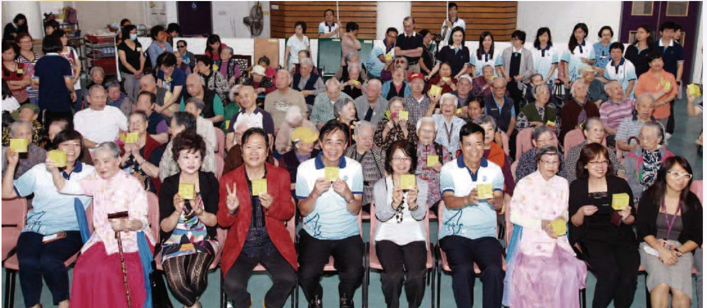
煤氣公司向在場近百位長者送上愛心月餅，共慶中秋。 Towngas distributed mooncakes to around 100 elderly people to celebrate the Mid-Autumn Festival.

中秋前夕，煤氣公司與香港盲人輔導會合作，在賽馬會屯門盲人安老院舉辦「關愛共融慶中秋」活動，與近百名長者一同慶祝中秋節。二十名視障長者在煤氣義工的指導及協助下，製作了「愛心月餅」。煤氣公司更邀請兩位資深藝人黃韻材和梁淑莊獻唱多首經典金曲，並與一眾長者大玩遊戲，和他們度過一個愉快溫馨的下午。