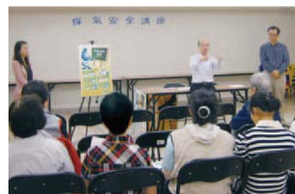
煤氣客戶服務關注小組於4月探訪維景灣畔。 Towngas Customer Focus Team visited Ocean Shores in April.

Consisting of senior staff from Customer Services, Customer Accounts and Retail Marketing, the team visits two public housing estates or private residential developments every month to discuss issues related to Towngas services, such as gas safety, bill payment and gas appliances. The team also solicits comments and views from customers so as to provide even better products and services.