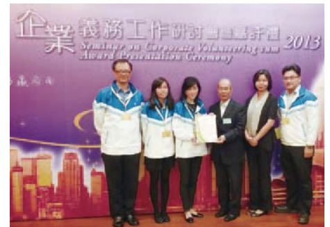
煤氣溫馨義工隊隊員接受獎項。 Members of the Volunteer Service Team received the award.

Initially focused on helping the elderly, our service programmes have expanded over the years to cover underprivileged groups such as low income families, new immigrant families and people with disabilities. Last year, our Volunteer Service Team in Hong Kong contributed a total of 68,508 hours of service to the community.