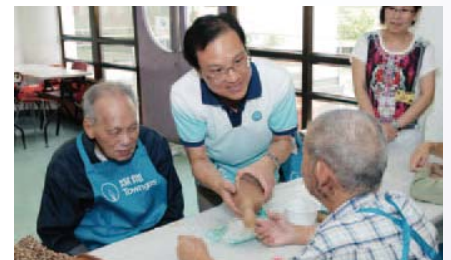
煤氣公司義工教導長者製作月餅。 Towngas volunteer made mooncakes with the participants.