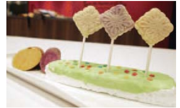
造型別致的低碳冰皮月餅。 The low carbon snowy mooncakes.

Under the guidance of our cooking centre instructor Pauline Wong, participants learnt how to make two different kinds of low carbon snowy mooncakes. They also had a tasting session, trying out the beautifully shaped mooncakes.