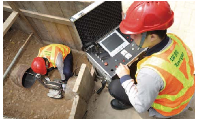
技術人員可透過Laparobot的鏡頭了解地底深坑管道內的情況。 The innovative design of the Laparobot enables technicians working on site to gauge the condition of underground pipes through the camera.

Laparobot的研發全因公司積極推廣創意文化，鼓勵同事提出方案，以改善工作流程，提升服務和產品的質素。是次獲獎對同事們的創意和努力予以莫大的肯定。