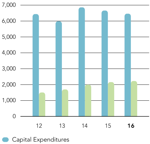
Depreciation and Amortisation