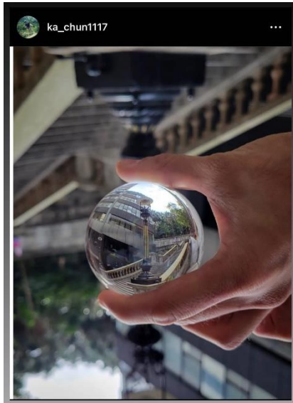
The Central gas street lamp as if in a crystal ball.