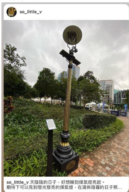
“On such a gloomy day, I look forward to seeing the gas lamp shedding light on the road.”, says @so_little_v in the photo caption.