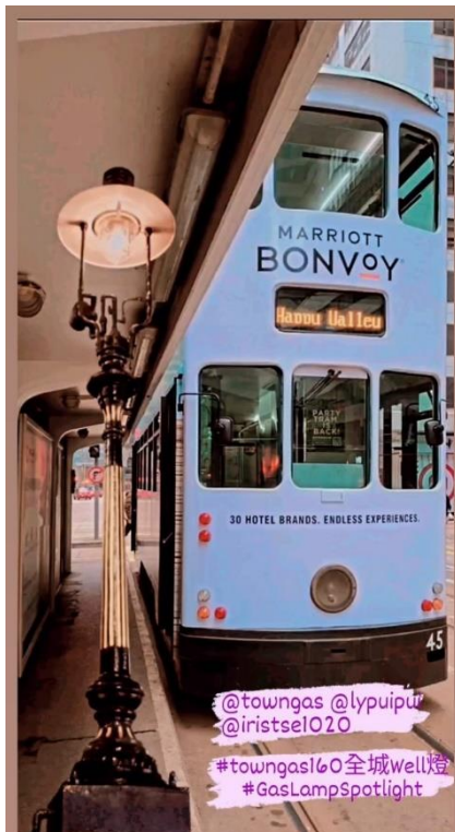
The gas lamp fits perfectly into the historic tram station.